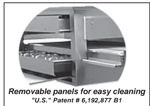
Removable panels for easy cleaning "U.S." Patent # 6,192,877 B1

Ideal for a variety of cooking applications including pizza, seafood, omelettes and other egg dishes, pre-cooked meats, cookies, bakery products, pita breads, heating plated Mexican food and hot submarine sandwiches.