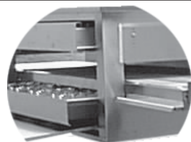
Removable panels for easy cleaning "U.S." Patent # 6,192,877 B1

Ideal for a variety of cooking applications including pizza, seafood, omelettes and other egg dishes, pre-cooked meats, cookies, bakery products, pita breads, heating plated Mexican food and hot submarine sandwiches.